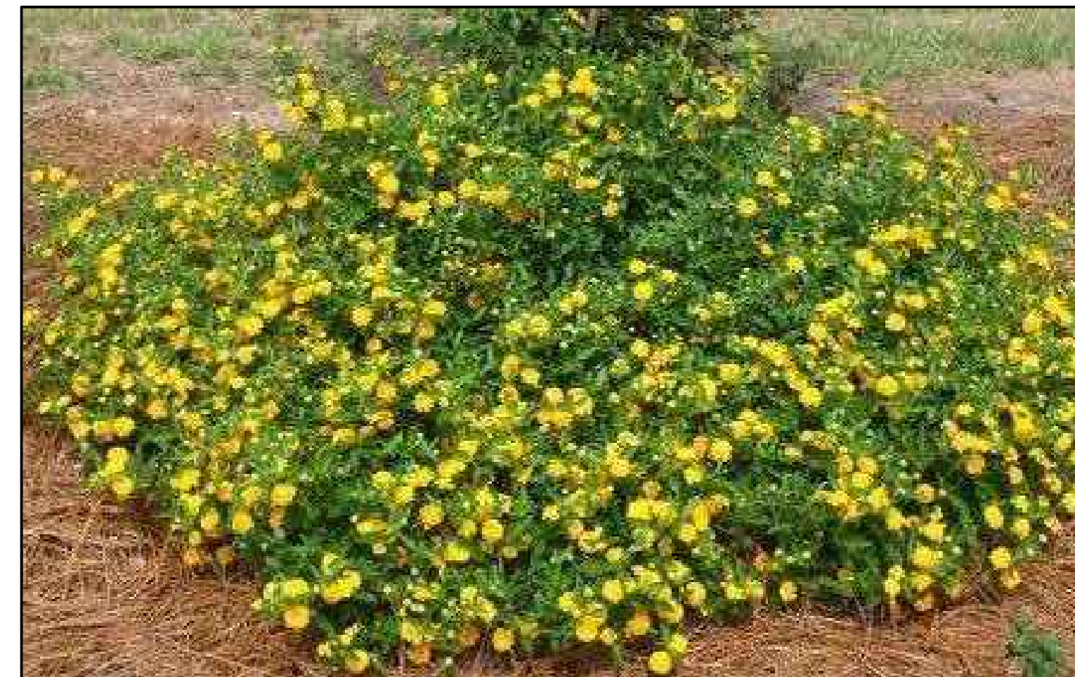
Lantana montevidensis 'New Gold'