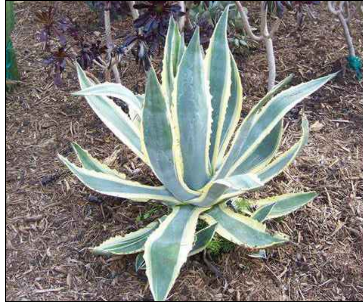
Agave angustifolia 'Variegata'