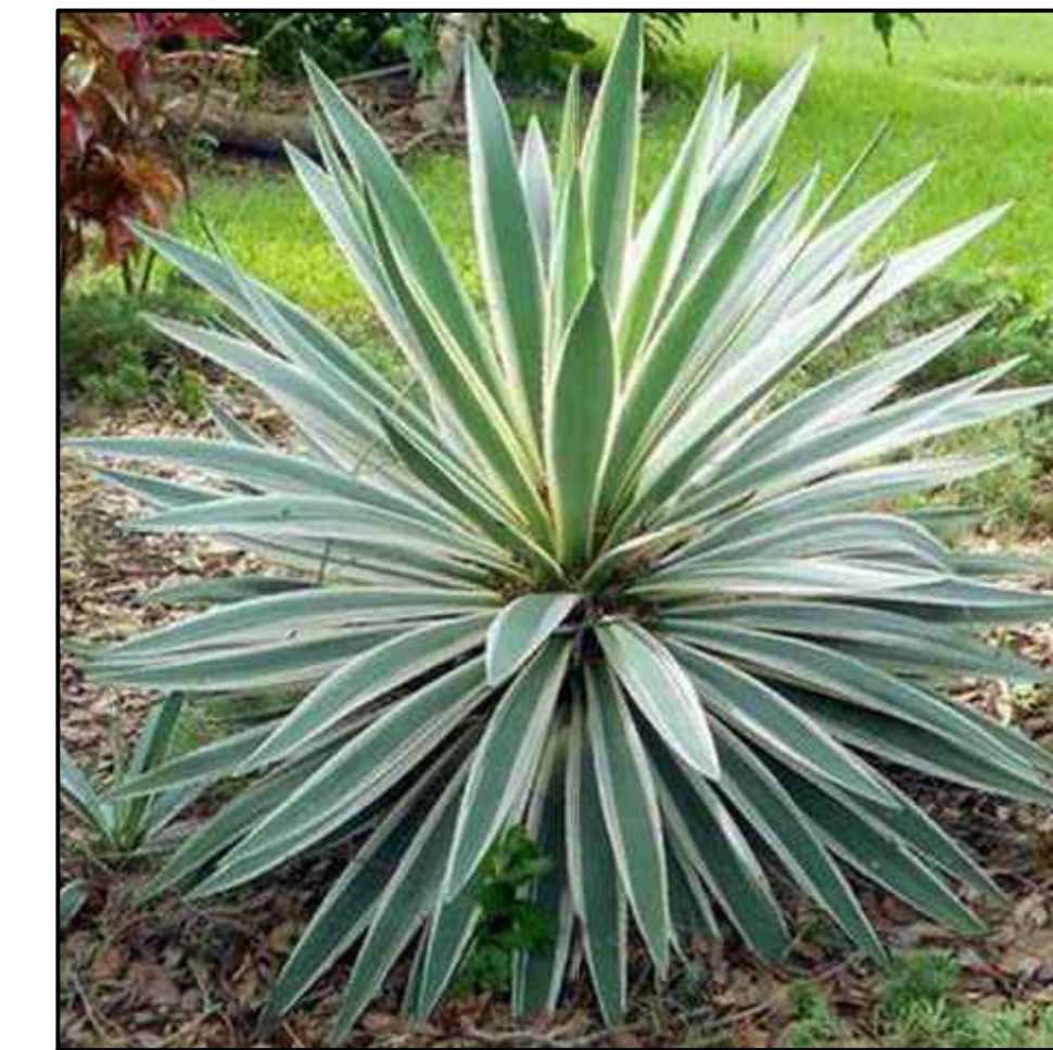
Yucca aloifolia 'Variegata'

DATE: 2/13/2023 MCG JOB #: 22.455.01 Wdal JOB #: 22061