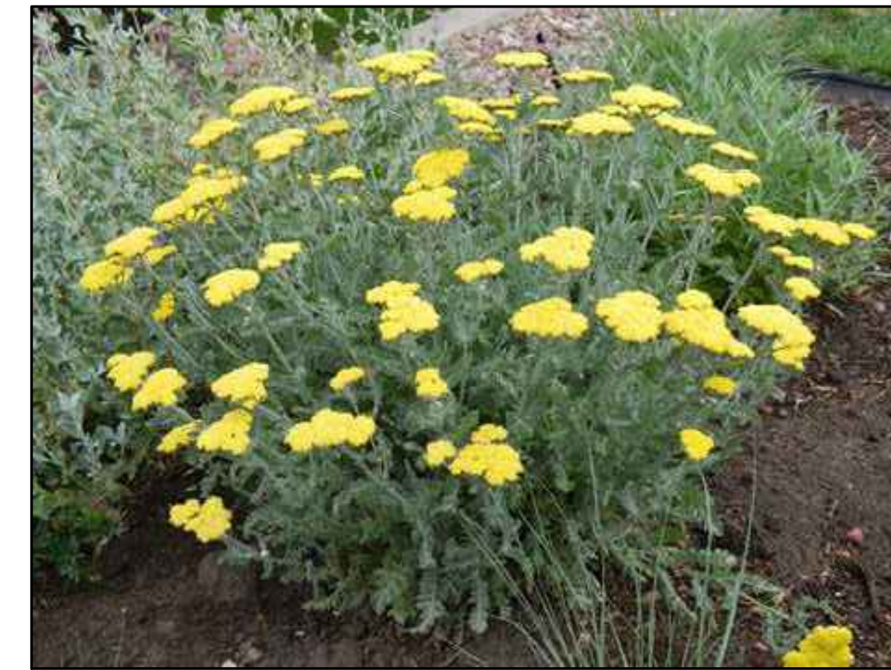
Achillea millefolium x 'Moonshine'