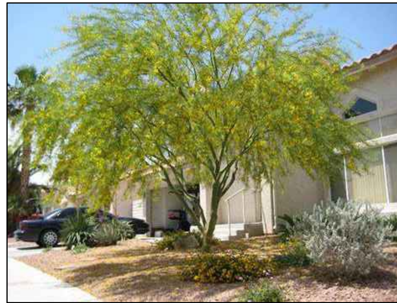
Cercidium x 'Desert Museum'