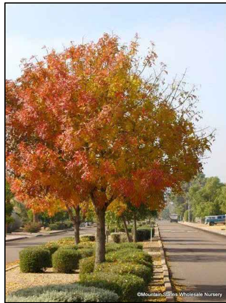
Pistacia x 'Red Push'