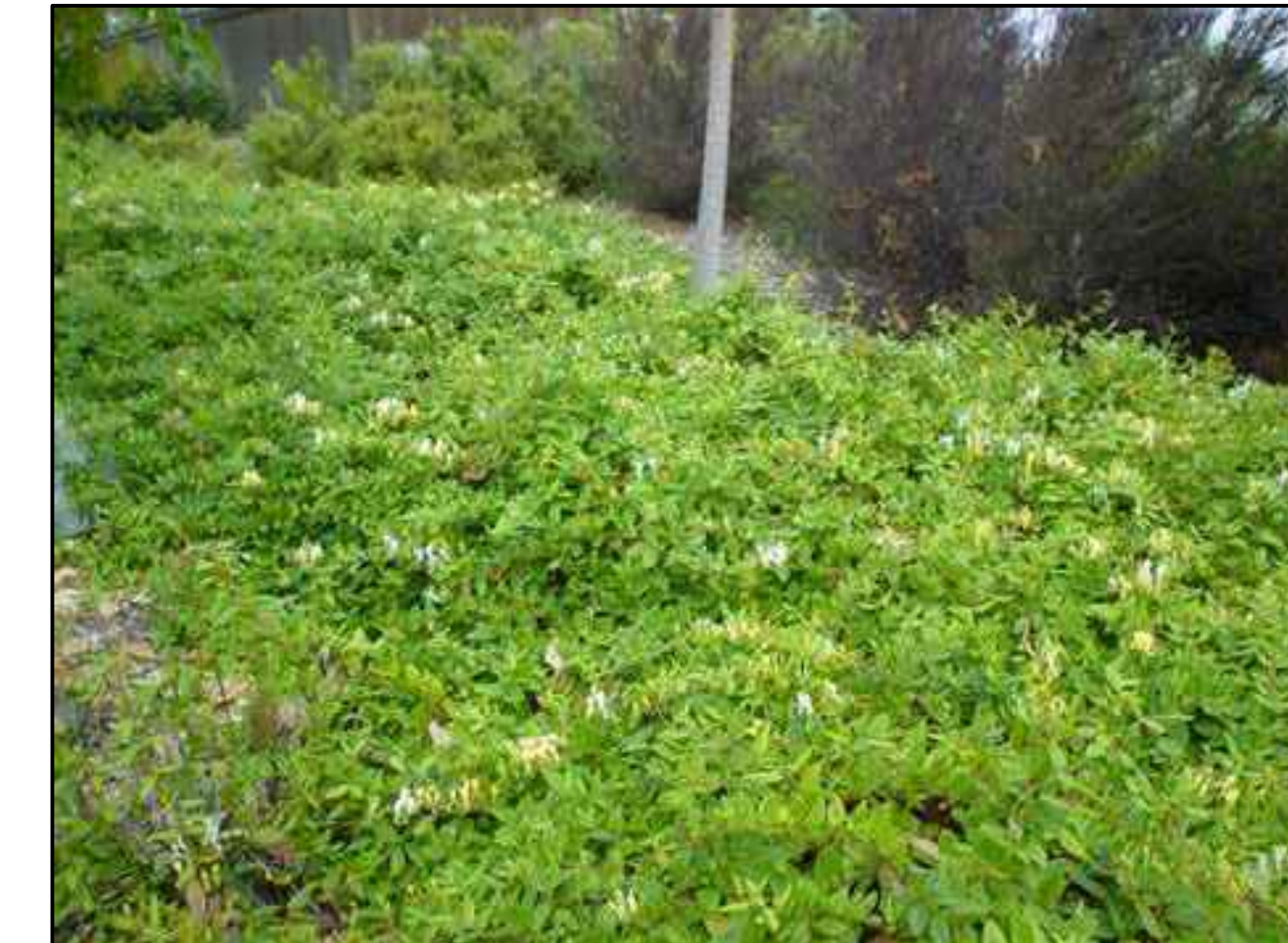
Lonicera japonica 'Halliana'