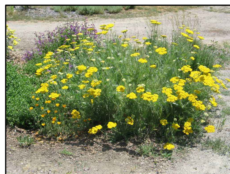
ACHILLEA MILLEFOLIUM 'MOONSHINE' - MOONSHINE YARROW