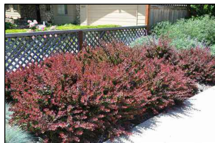
BERBERIS THUNBERGII 'ATROPURPUREA' - RED LEAF BARBERRY