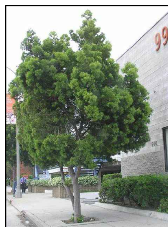
PODOCARPUS GRACILIOR - FERN PINE