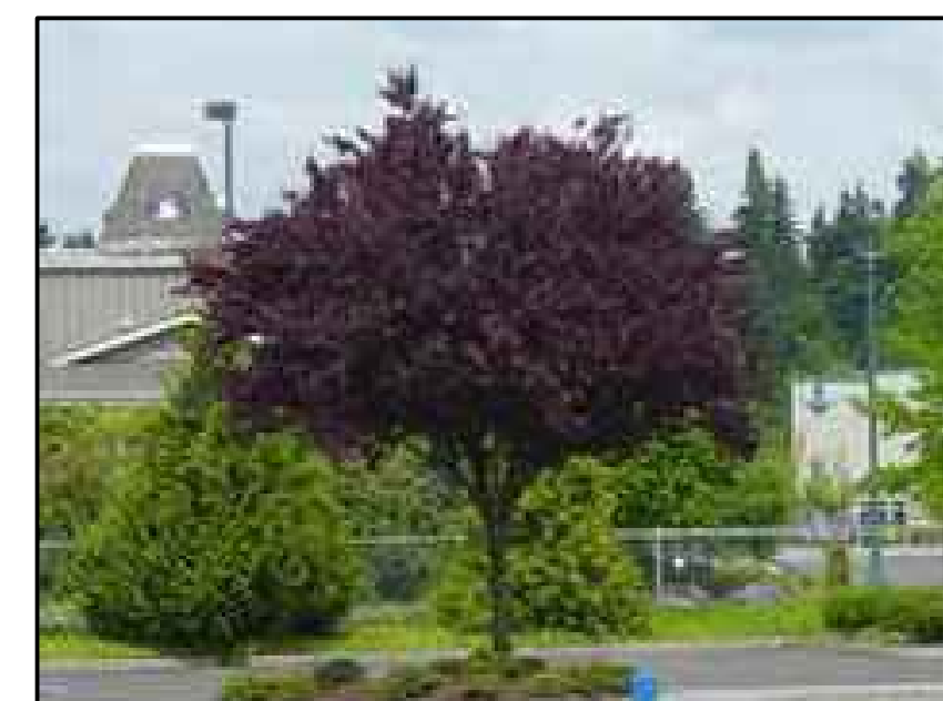
PRUNUS CERASIFERA 'THUNDERCLOUD' - THUNDERCLOUD PURPLE LEAF PLUM