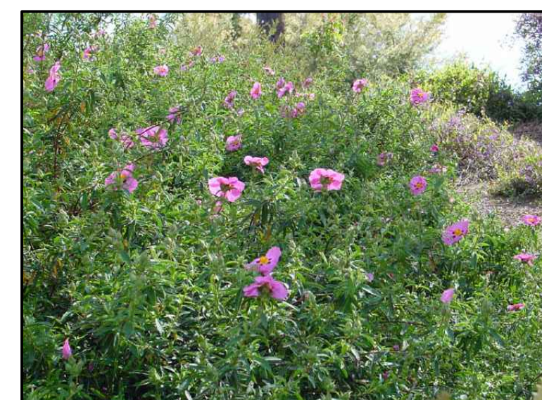
CISTUS INCANUS - PINK ROCK ROSE

THE LANDSCAPE CONTRACTOR BY BIDDING THIS PROJECT ACKNOWLEDGES THAT HE HAS VISITED THE SITE(S) AND HAS SUBSTANTIAL KNOWLEDGE TO COMPLETE THE PROPOSED SCOPE OF WORK WITHOUT ANY ADDITIONAL COST TO THE OWNER.